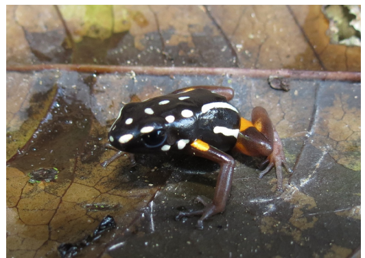
Figure 1. Adult Adelphobates castaneoticus (CEPB 9295) from municipality of Jacareacanga, Pará State, Brazil.