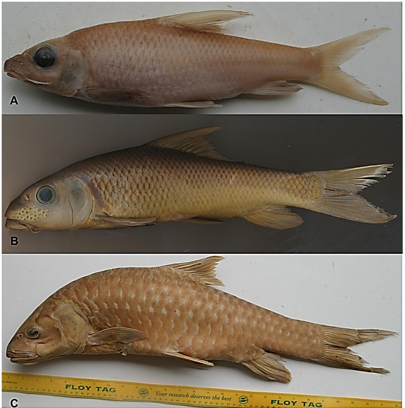
Figure 3. Hypselobarbus dubius , H. kolus , and Tor mussullah sensu Hora. (A) Hypselobarbus dubius MSUMNH 243, 168.32 mm SL, Bhavani River at Athikadavu (collected by Dr. M. Arunachalam and team), (B) Hypselobarbus kolus CMA 47, 186.82 mm SL, Basavanahalli, Cauveri River basin (collected by M. Arunachalam), and (C) Tor mussullah sensu Hora MSUMNH 104, 515 mm SL, nearly 4.5 kg, Sholayar Dam, Chalakudi River basin, collected by M. Arunachalam.

moderately falcate, extending to 1.5-2 scale rows anterior to pelvic fin insertion. Caudal fin deeply forked 25.03-32.60 %SL, upper and lower lobes 5 times longer than middle rays.